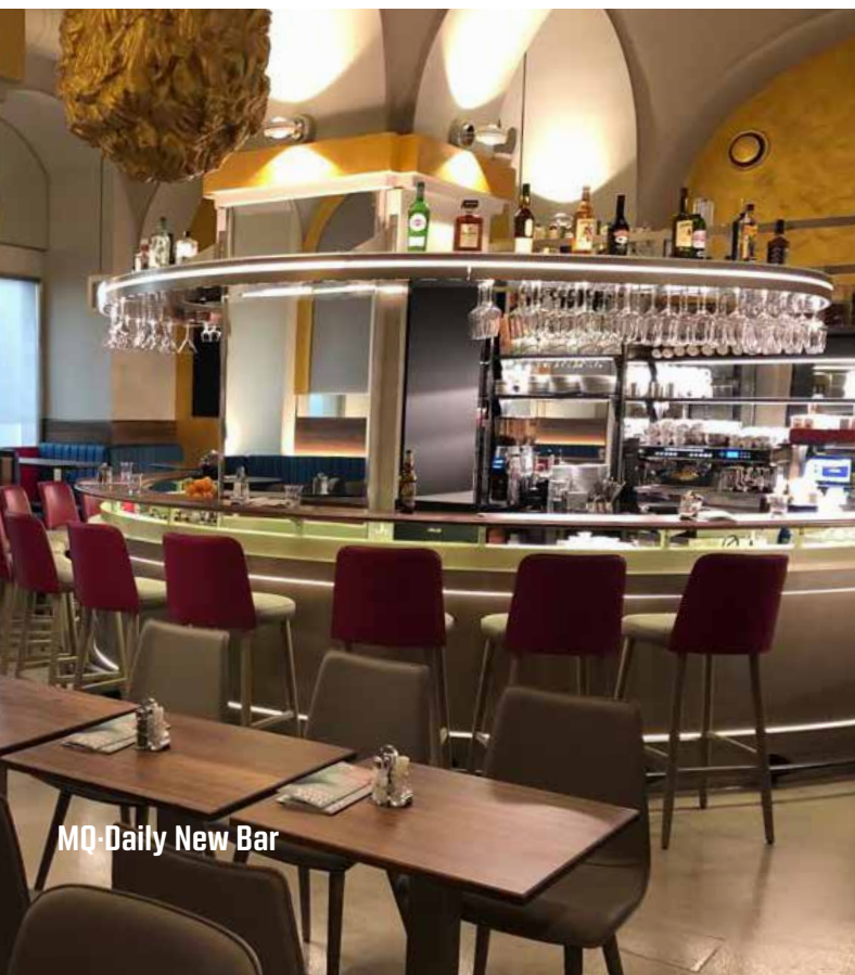
MQ-Daily New Bar

Allergen guidance recommendations can be found at the end of this menu.