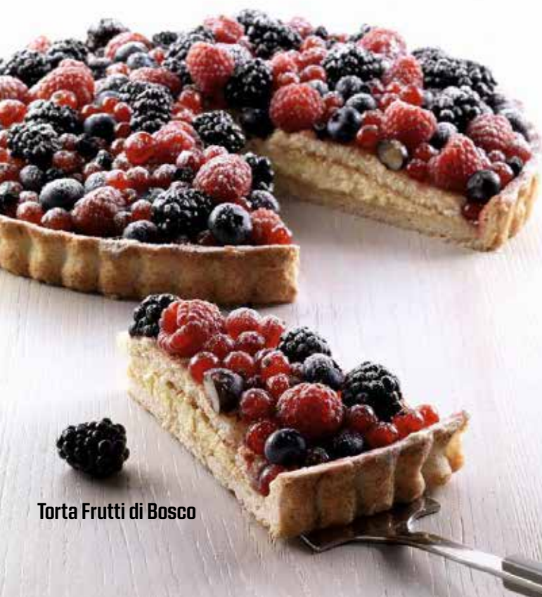
Torta Frutti di Bosco